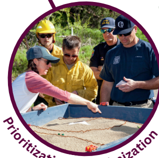
Prioritization & Optimization

Improves forest and watershed health by restoring springs and streams, protecting aspen stands, and mitigating post-fire flooding .