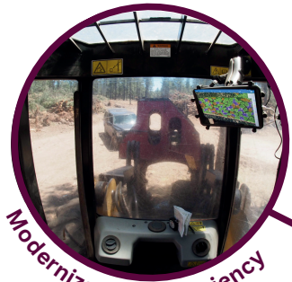
Modernization & Efficiency

Partners have created more than 40 key resources , including foundational, operational, and strategic planning documents , as well as monitoring analyses, position statements, and resolutions .