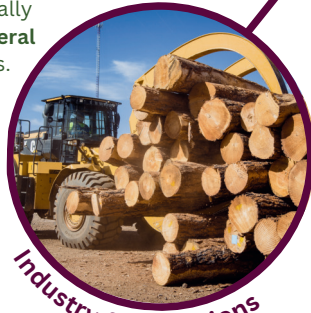
Industry & Operations

Uses innovative practices and technologies to do more with less. On 4FRI, 20 acres can be marked digitally for every 1 acre traditionally painted, reducing federal costs up to 13 times.