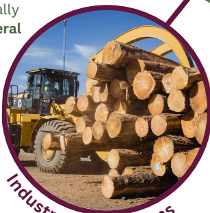
Industry & Operations

Uses innovative practices and technologies to do more with less. On 4FRI, 20 acres can be marked digitally for every 1 acre traditionally painted, reducing federal costs by 13 times.