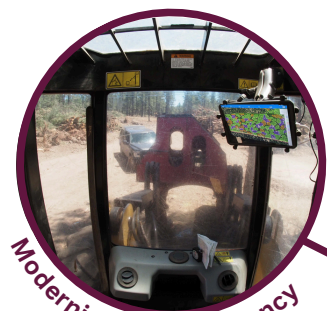
Modernization & Efficiency

Partners have created more than 40 key resources , including foundational, operational, and strategic planning documents , as well as monitoring analyses, position statements, and resolutions .