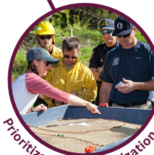
Prioritization & Optimization

Improves forest and watershed health by restoring springs and streams, protecting aspen stands, and mitigating post-fire flooding .