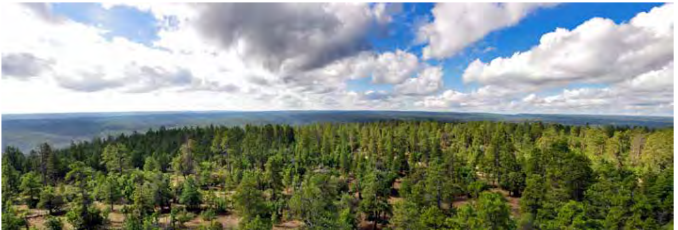
Northern Arizona is home to the largest contiguous ponderosa pine forest in North America. The Four Forest Restoration Initiative, known as 4FRI, was formed as a collaborative effort to restore forest ecosystems on portions of four Arizona National Forests, which include the Apache-Sitgreaves, Coconino, Kaibab, and Tonto.