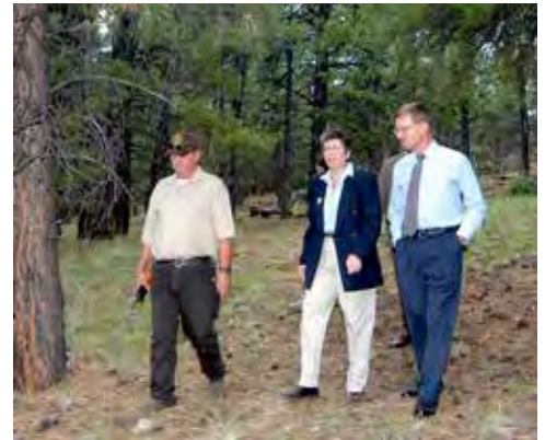
Arizona Governor Janet Napolitano visits a restoration project near Flagstaff in 2004. Her support for forest restoration efforts across the state energized members of the Forest Health Advisory Council and the Forest Health Oversight Council and fueled a productive time in the events that led to the formation of 4FRI.

2005: The Arizona Governor’s Forest Health Advisory Council and the Governor’s Forest Health Oversight Council select a subcommittee, led by Aumack and Sisk, to frame a 20-year forest strategy for Arizona.