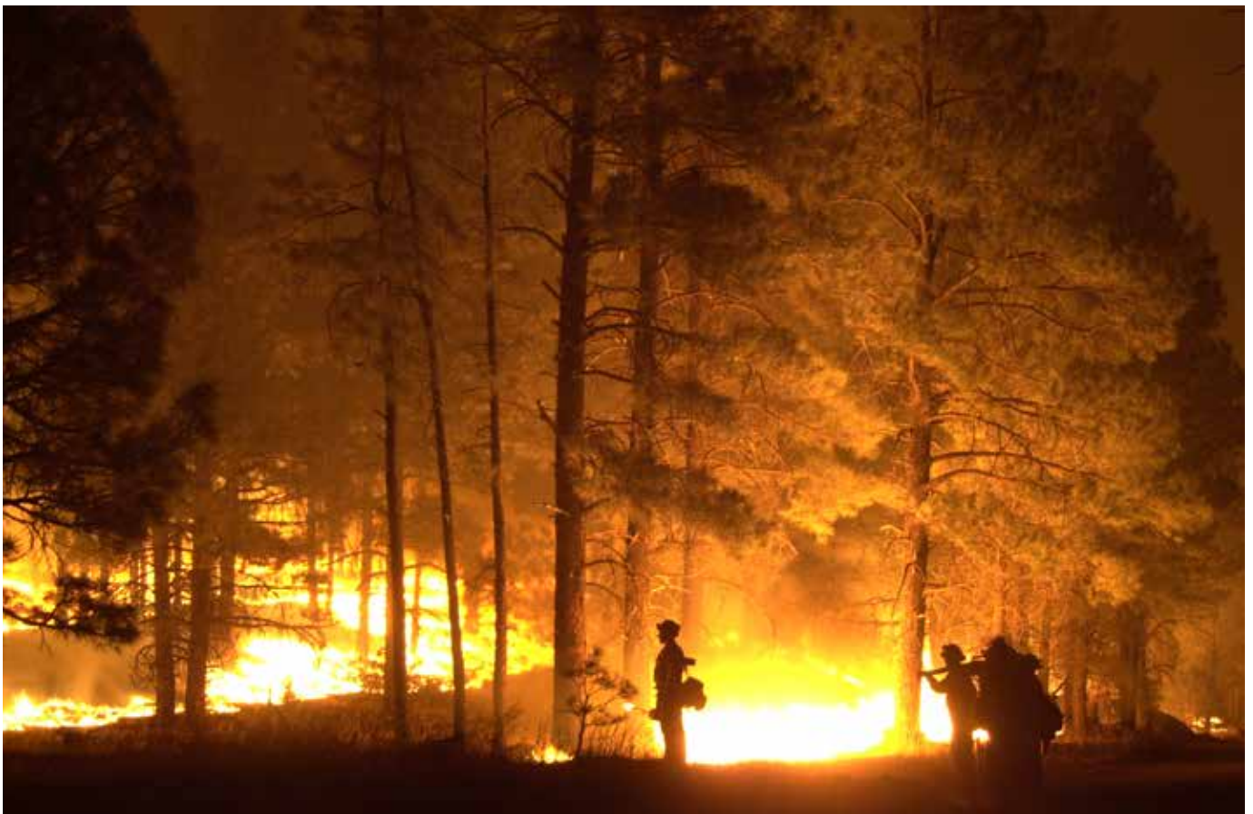
The Rodeo-Chediski Fire of 2002 burned nearly 500,000 acres in east-central Arizona and was a key ecological event that helped spur the passage of the Healthy Forests Restoration Act.