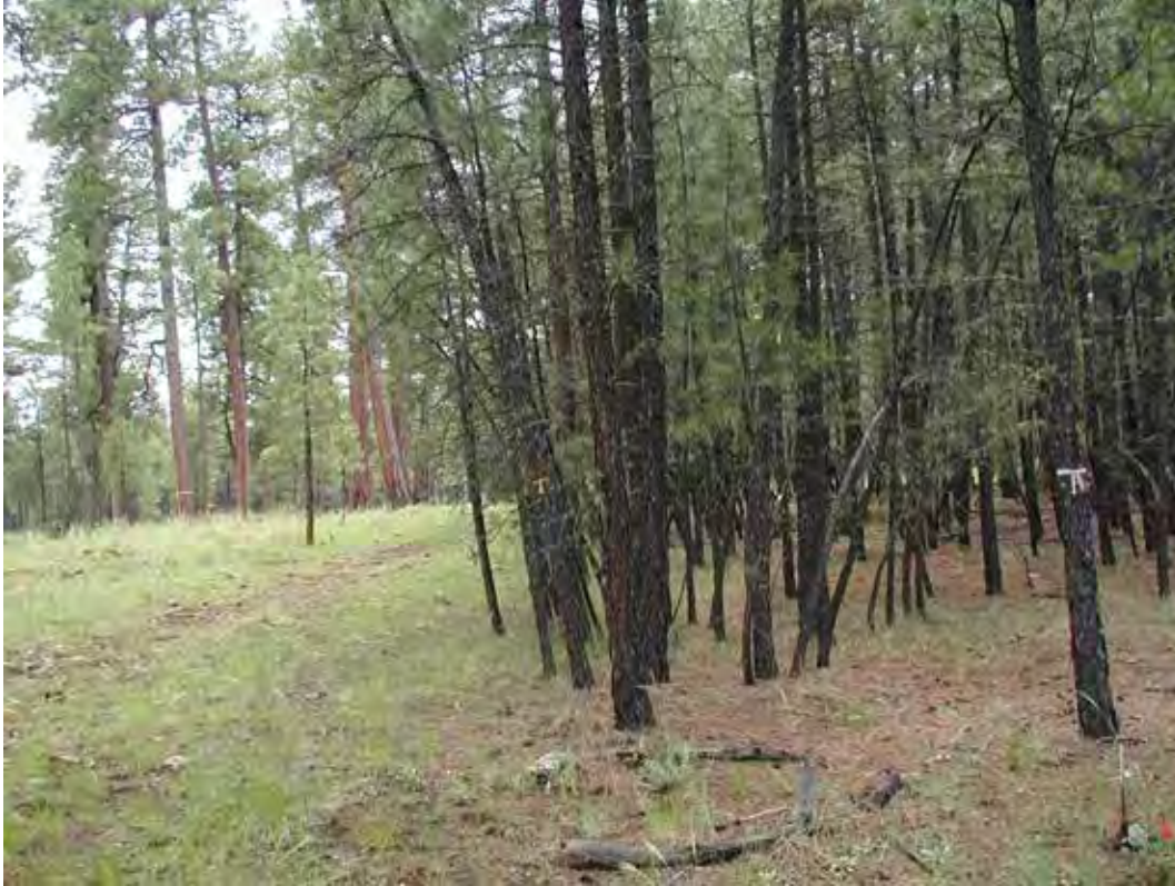
A dense, dog-hair thicket of Ponderosa pine stands in contrast to a more open, restored forest in the G.A. Pearson Natural Area within the Fort Valley Experimental Forest. Evidence gathered here in the 1990s by forest ecologists, including Wally Covington of the Ecological Restoration Institute, bolstered the need for science-based forest restoration.