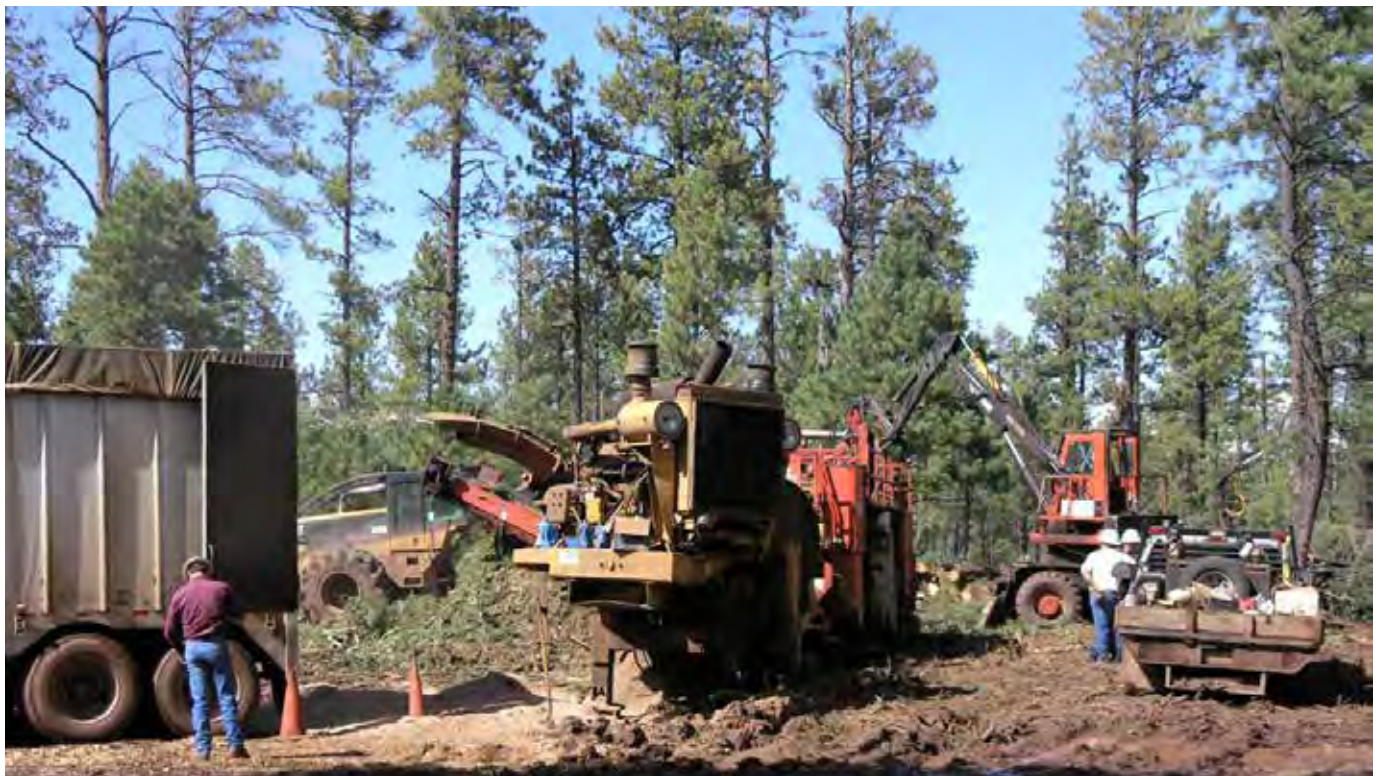
Forest restoration work is conducted on the Apache-Sitgreaves National Forest under the White Mountain Stewardship Contract. The WMSC was the largest 10-year stewardship contract in the nation and served as a testing ground for the use of stewardship contracting.