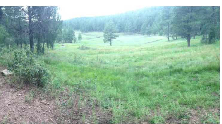
Clockwise from top: T-six Spring from the spring source, 2017; before restoration; after restoration; volunteers made it possible (bottom left); Houston Draw – the CIWG and Arizona Elk Society's next collaborative restoration project.

The next project we are tackling is Houston Draw on the Coconino National Forest. A perennial section of Houston Draw and its surrounding meadow is experiencing down-cutting and riparian degradation. We now have an engineering design and will be working with our partners in 2019 and 2020 to restore this meadow to its proper condition.