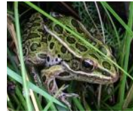
Northern Leopard Frog

Rosilda Spring is located about 10 miles southeast of Williams. It is a perennial spring that feeds a livestock and wildlife water on the Williams Ranger District. A well had been excavated near the spring source and lined with rocks,